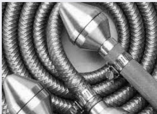
COLLUM® HOSE & NOZZLE