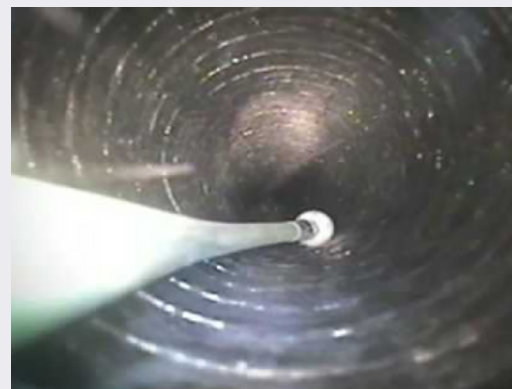
THE HOSE & NOZZLE AT WORK